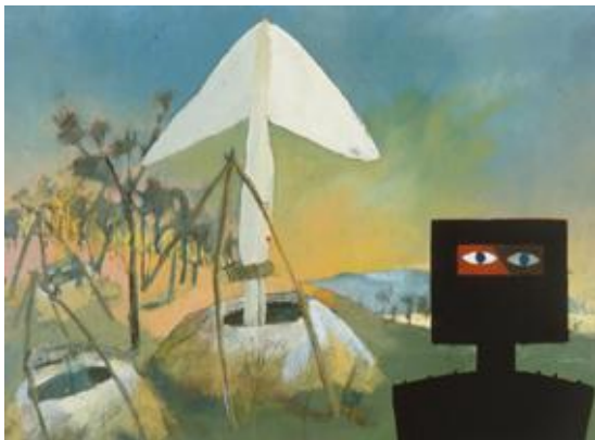
Sidney Nolan, Kelly at the Mine c. 1947, enamel on composition board, 90 x 121.3 cm, Heide Museum of Modern Art Collection, Melbourne, Purchased from John and Sunday Reed, 1980

In Heide III , the Kerry Gardner & Andrew Myer Project Gallery and Albert & Barbara Tucker Gallery will show paintings and drawings from the 1940s by some of the artists most often associated with Heide, and whom the Reeds counted as their friends, including Joy Hester, Sidney Nolan, John Perceval and Albert Tucker . This section of the exhibition also reflects the Reeds' close involvement in the Contemporary Art Society and their affiliation with the local development of Social Realism, Surrealism and Expressionism.