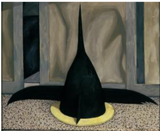
John Brack, The Fish Shop 1995, oil on composition board, 60 x 70.8 cm, Gift of the Trustees of the Museum of Modern Art and Design of Australia, to the National Gallery of Victoria 1981. Transferred to Heide Museum of Modern Art by the Council of Trustees of the National Gallery of Victoria 2005