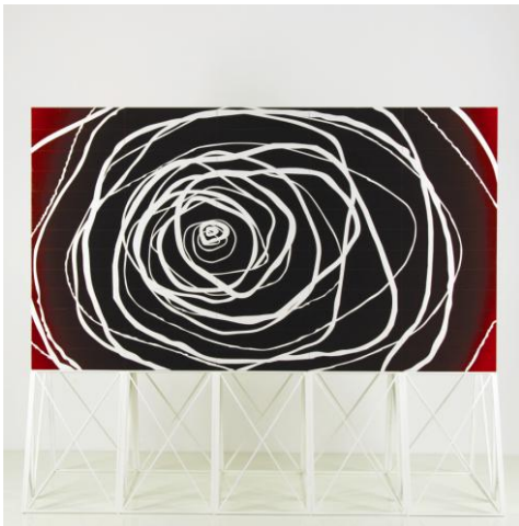
Callum Morton | Screen #17: Reverse Amnesia 2007 synthetic polymer paint | 110 x 95 45.5 cm