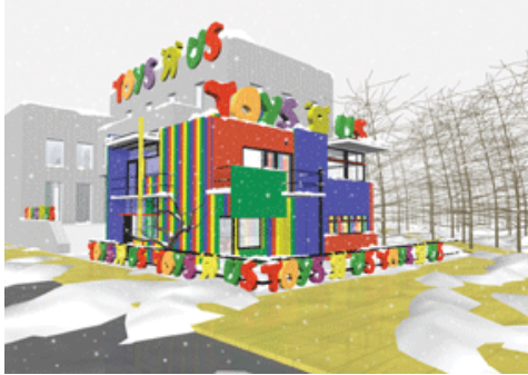
Callum Morton | Toys 'R' Us , Utrecht 2001 digital print on archival paper | 58.5 x 84 cm Michael Buxton Collection