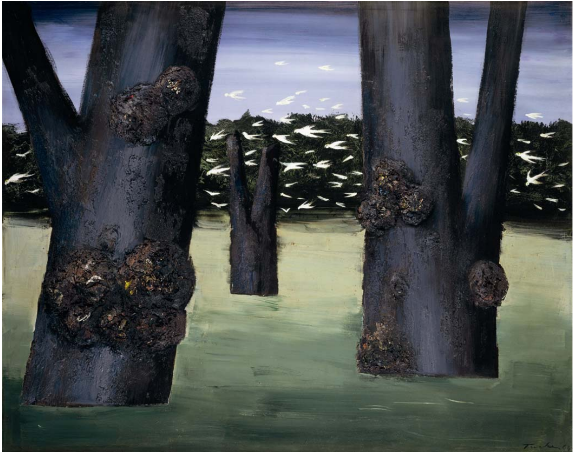
Albert Tucker Cockatoos, Barmah 1964 mixed media on hardboard 121.0 x 151.3 cm Art Collection of National Australia Bank Limited Purchased 1982 © Barbara Tucker