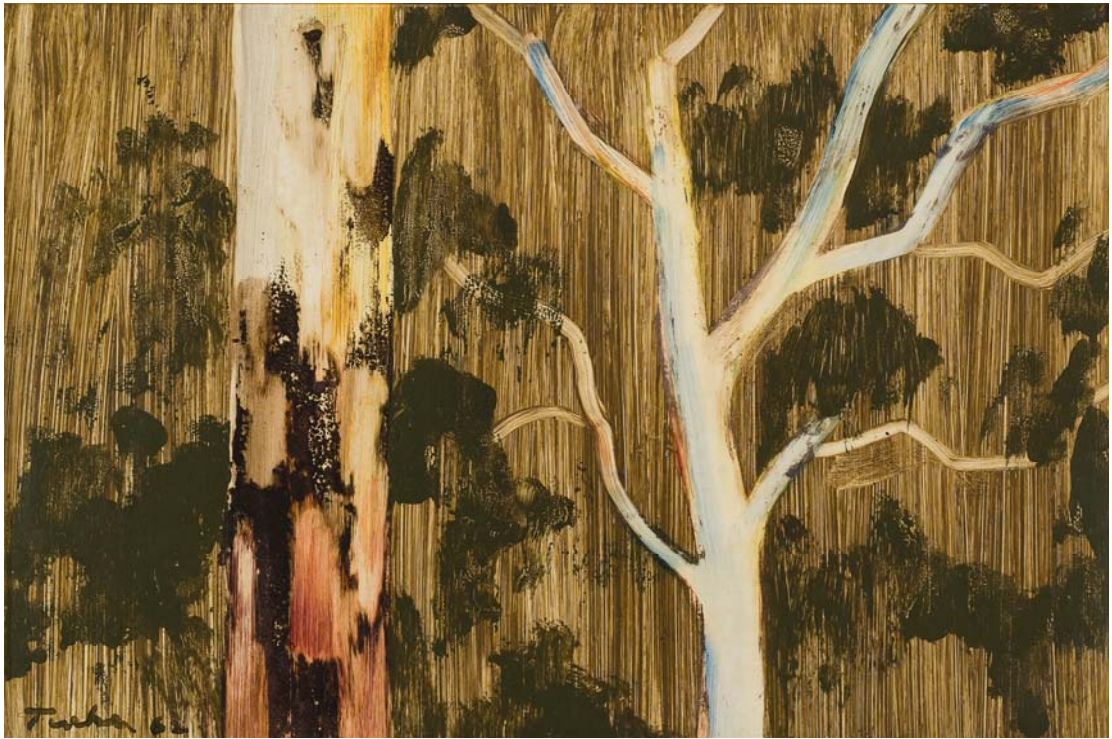
Albert Tucker Bush 5 1962 oil on cardboard on composition board 24.2 x 36.4 cm Bendigo Art Gallery Collection Bequest of BS Andrew 1982 © Barbara Tucker

Hinterlands: Albert Tucker's landscapes 1960–1975